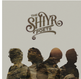
Songs for the Journey, Volume 1 The SHIYR Poets music CD